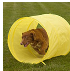
Outward Hound™ Zipzoom Agility Starter Kit