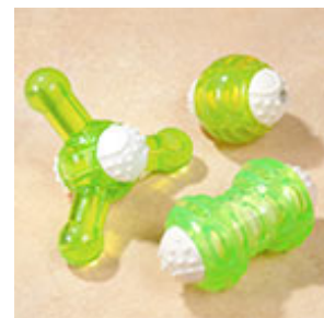
Hyper Pet Hyper Squawker Interactive Dog Toy