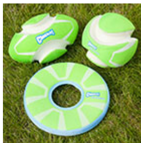
Chuckit!® Max Glow™ Fetch Toys for Dogs