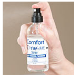
Comfort Zone® Spray with