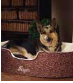
Beds & Bedding