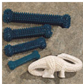
Nylabone Dental Chews for Dogs