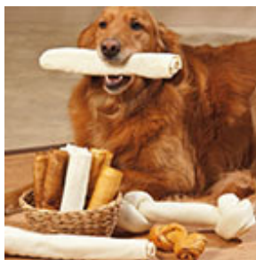
Drs. Foster & Smith Super Heavyweight Rawhide Dog Bones