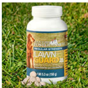
Drs. Foster & Smith Lawn Guard®