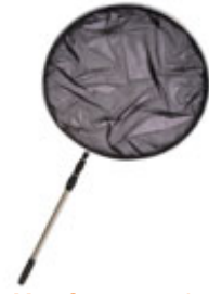
Net for scooping up clipped spent plants