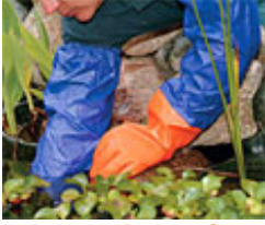
Long gloves for reaching into cold water