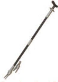
Pruning Tool for clipping spent plant leaves