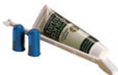
DOCTORS FOSTER & SMITH Cat Dental Kit