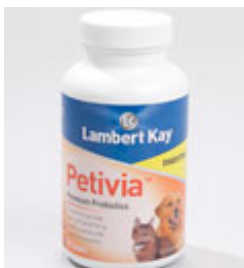
Petivia™ Premium Probiotics