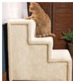
DOCTORS FOSTER & SMITH Heavy-Duty Carpeted Stair-Steps