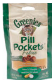
Greenies® Feline Pill Pockets

years, not only to diagnose and treat ailments, but also to prevent a series of related problems that can occur if one ailment goes untreated.