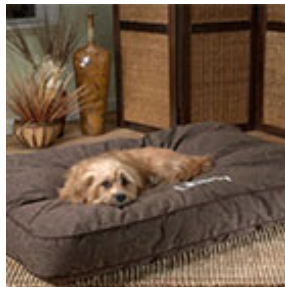
Drs. Foster & Smith Ultimate Classic Dog Bed with ScentLok® Odor Control