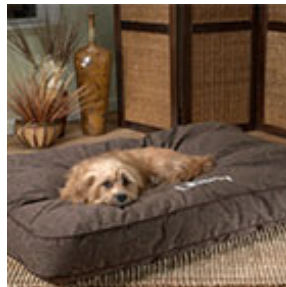
Drs. Foster & Smith Ultimate Classic Dog Bed with ScentLok® Odor Control