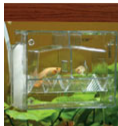
Baby Nursery for Live Bearers