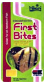
Hikari First Bites

The following are some additional items that you may find useful.