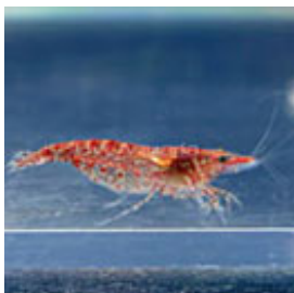
Red Cherry Shrimp (Neocaridina denticulata sinensis)