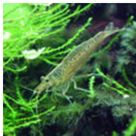
Japonica Amano Shrimp (Caridina japonica)