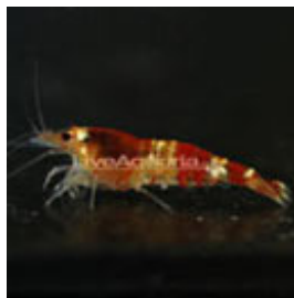
Red Crystal Shrimp (Caridina sp.)