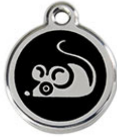
Red Dingo Cat ID Tag w/Free Personalization – Black Mouse