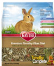
Kaytee Timothy Complete Plus Rabbit Diet