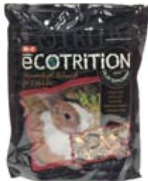
8 In 1 Ecotrition Rabbit Diet

Dehydrated Alfalfa Meal, Ground Corn, Heat Processed Soybeans, Whole Corn, Oat Groats, Barley, Sunflower Seed, Soybean Meal, Timothy Hay, Wheat Middlings, Soybean Hulls, Carrot Slices, Green Split Peas, Feeding Oatmeal, Yellow Split Peas, Diced Apples, Diced Pineapple, Cane Molasses, Salt, Diced Carrots, Diced Potatoes, Minced Onions, Parsley Flakes, Celery Flakes, Diced Red Peppers, Diced Green Peppers, Cabbage Flakes, Leek Flakes, Diced Zucchini, Tomato Fakes, Spinach Flakes, Ground Limestone, Dicalcium Phosphate, Choline Chloride, Vitamin A Acetate, D-Activated Animal Sterol, dl-Alpha Tocopheryl Acetate, Niacin, Riboflavin, Pyridoxine Hydrochloride, Thiamine Monohydrate, d-Calcium Pantothenate, Vitamin B12 Supplement, Menadione, Sodium Bisulfate Complex, Folic Acid, Biotin, Magnesium Oxide, Ferrous Carbonate, Ferrous Sulfate, Zinc Oxide, Manganous Oxide, Copper Sulfate, Calcium Iodate, Cobalt Carbonate, and Color Added : FD & C Red #40, FD & C Yellow #5, FD & C Yellow #6, FD & C Blue #1.