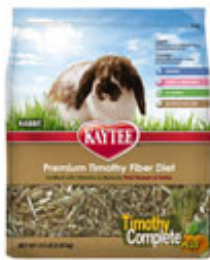
Kaytee Timothy Complete Plus Rabbit Diet Flowers & Herbs