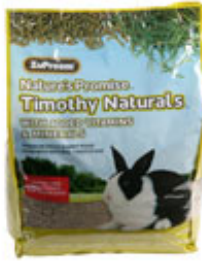
ZuPreem Nature's Promise Timothy Rabbit Food

Suncured Timothy Hay, Soybean Hulls, Dried Alfalfa Meal, Soybean Meal, Wheat Middlings, Dried Molasses, Sodium Bentonite, Flaxseeds, Salt, Calcium Propionate, Zinc Propionate, Preserved with Mixed Tocopherols and Citric Acid, Choline Chloride, DL-Methionine, Zinc Sulfate, Vitamin E Supplement, Dried Yucca schidigera Extract, Copper Sulfate, Ferrous Sulfate, Manganese Sulfate, Niacin, Calcium Pantothenate, Vitamin A Supplement, Riboflavin, Pyridoxine Hydrochloride, Thiamine Mononitrate, Sodium Selenite, Biotin, Vitamin B12 Supplement, Calcium Iodate, Vitamin D3 Supplement, Cobalt Carbonate, Folic Acid, Dried Bacillus licheniformis Fermentation Product, Dried Bacillus subtilis Fermentation Product, Copper Amino Acid Complex, Manganese Amino Acid Complex, and Rosemary Extract.