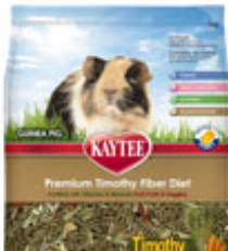
Kaytee Timothy Guinea Pig

Sun-cured Timothy Grass Hay, Wheat Middlings, Ground Wheat, Oat Hulls, Dehulled Soybean Meal, Sun-cured Alfalfa Meal, Dried Cane Molasses, Fennel Seed, Caraway Seed, Dehydrated Spearmint, Salt, Dicalcium Phosphate, Soy Oil, Calcium Carbonate, Dried Marigold, DL-Methionine, Ascorbyl-2-Polyphosphate (source of Vitamin C), Yucca Schidigera Extract, Vitamin A Supplement, Choline Chloride, Mixed Tocopherols (a preservative), Ferrous Sulfate, Riboflavin Supplement, Manganous Oxide, Zinc Oxide, Vitamin B12 Supplement, Vitamin E