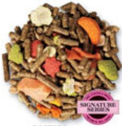
DOCTORS FOSTER & SMITH Drs. Foster and Smith Signature Series Guinea Pig Food

Groats, Vegetable Oil, L-Ascorbyl-2-Polyphosphate, Calcium Carbonate, Yucca schidigera Extract, Dried Lactobacillus acidophilus Fermentation Product, Dried Lactobacillus casei Fermentation Product, Dried Enterococcus faecium Fermentation Product, Dried Bifidobacterium bifidum Fermentation Product, Dried Aspergillus oryzae Fermentation Product, Torula Dried Yeast, Choline Chloride, Magnesium Oxide, Potassium Sulfate, Magnesium Sulfate, Vitamin A Supplement, Algae Meal, Fructooligosaccharide, DL-Methionine, Vitamin E Supplement, Vitamin D3 Supplement, Ground Steam-Rolled Oats, L-Lysine, Niacin Supplement, Vitamin B12 Supplement, Riboflavin Supplement, d-Calcium Pantothenate, Menadione Sodium Bisulfite Complex, Biotin, Folic Acid, Thiamine Mononitrate, Pyridoxine Hydrochloride, Zinc Sulfate, Ferrous Sulfate, Manganese Sulfate, Copper Sulfate, Ethylenediamine Dihydroiodide, Cobalt Sulfate, Sodium Selenite, and Color Added (Yellow 5, Blue 1, Red 40, Titanium Dioxide).