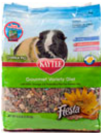
Kaytee Fiesta Guinea Pig

Sun-cured Alfalfa Hay, Ground Corn, Dehulled Soybean Meal, Wheat Middlings, Oats, Ground Oats, Wheat, Corn, Ground Wheat, Hulled Sunflower, Oat Groats, Green Split Peas, Barley, Dehydrated Carrots, Ground Flax Seed, Shelled Peanuts, Dried Bananas, Raisins, Pumpkin Seed, Safflower Seed, Dicalcium Phosphate, Oat Hulls, Dried Cane Molasses, Ground Rice, Dried Papaya, Dehydrated Sweet Potatoes, Dehydrated Apples, Soy Oil, Salt, Calcium Carbonate, Potassium Chloride, Magnesium Oxide, Algae Meal (source of DHA), L-Ascorbyl-2-Polyphosphate (source of Vitamin C), Fructooligosaccharide, DL-Methionine, L-Lysine, Yeast Extract, Yucca schidigera Extract, Vitamin A Supplement, Choline Chloride, Mixed Tocopherols (preservative), Titanium Dioxide, Ferrous Sulfate, Riboflavin Supplement, Manganous Oxide, Zinc Oxide, Vitamin B12 Supplement, Vitamin E Supplement, Niacin, Menadione Sodium Bisulfite Complex (source of Vitamin K activity), Rosemary Extract, Citric Acid, Cholecalciferol (source of Vitamin D3), Calcium Pantothenate, Pyridoxine Hydrochloride, Thiamine Mononitrate, Biotin, Folic Acid, Calcium Iodate, Cobalt Carbonate, Sodium Selenite, Dried Bacillus licheniformis Fermentation Product, Dried Bacillus subtilis Fermentation Product, FD&C Yellow #5, FD&C Red #40, FD&C Blue #1, FD&C Red #3.