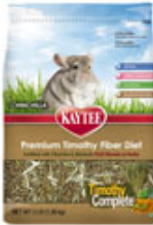
Kaytee® Timothy Complete Plus Flowers & Herbs

Sun-cured Timothy Grass Hay, Dehydrated Alfalfa Meal, Dehulled Soybean Meal, Wheat Middlings, Ground Oats, Ground Wheat, Oat Hulls, Dried Beet Pulp, Dried Cane Molasses, Fennel Seed, Caraway Seed, Dicalcium Phosphate, Dehydrated Spearmint, Wheat Germ Meal, Salt, Soy Oil, Calcium Carbonate, Dried Marigold, DL-Methionine, Vitamin A Supplement, Choline Chloride, Yucca schidigera Extract, Mixed Tocopherols (a preservative), Riboflavin Supplement, Ferrous Sulfate, Vitamin B12 Supplement, Vitamin E Supplement, Manganous Oxide, Zinc Oxide, Niacin, Copper Sulfate, Menadione Sodium Bisulfite Complex (source of Vitamin K activity), Rosemary Extract, Citric Acid, Cholecalciferol (source of Vitamin D3), Calcium Pantothenate, Pyridoxine Hydrochloride, Thiamine Mononitrate, Biotin, Folic Acid, Calcium Iodate, Dried A. oryzae Fermentation Extract (source of Protease), Dried Bacillus licheniformis Fermentation Product, Dried Bacillus subtilis Fermentation Product, Cobalt Carbonate, and Sodium Selenite.