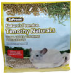
ZuPreem Nature's Promise Timothy Naturals™ Premium Adult

Sun-cured timothy hay, Soybean hulls, Dried alfalfa meal, Soybean meal, Wheat middlings, Dried molasses, Sodium bentonite, Flaxseeds, Salt, Calcium propionate, Zinc propionate, preserved with Mixed tocopherols and Citric acid, Choline chloride, DL-Methionine, Zinc sulfate, Vitamin E supplement, Dried Yucca schidigera extract, Copper sulfate, Ferrous sulfate, Manganese sulfate, Niacin, Calcium pantothenate, Vitamin A supplement, Riboflavin, Pyridoxine hydrochloride, Thiamine mononitrate, Sodium selenite, Biotin, Vitamin B12 supplement, Calcium iodate, Vitamin D3 supplement, Cobalt carbonate, Folic acid, Dried Bacillus licheniformis fermentation product, Dried Bacillus subtilis fermentation product, Copper amino acid complex, Manganese amino acid complex, Rosemary extract.