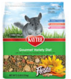
Kaytee® Fiesta Chinchilla

Sun-cured Alfalfa Meal, Whole Oats, Dehulled Soybean Meal, Ground Oats, Ground Wheat, Wheat Middlings, Ground Corn, Oat Groats, Barley, Sunflower, Wheat, Raisins, Dried Banana, Dried Papaya, Peanuts, Dehydrated Carrots, Wheat Flour, Dried Beet Pulp, Dehydrated Sweet Potato, Ground Rice, Dried Cranberry, Dicalcium Phosphate, Dehydrated Apple, Rice Flour, Soy Oil, Dried Cane Molasses, Wheat Germ Meal, Salt, DL-Methionine, Whole Cell Algae Meal (source of Omega-3 DHA), Fructooligosaccharide, Calcium Carbonate, Magnesium Oxide, Vitamin A Supplement, Choline Chloride, L-Lysine, Yeast Extract, Sesame Seed, Yucca schidigera Extract, Mixed Tocopherols (a preservative), Riboflavin Supplement, Ferrous Sulfate, Vitamin B12 Supplement, Vitamin E Supplement, Manganous Oxide, Zinc Oxide, Niacin, Potassium Chloride, L-Ascorbyl-2-Polyphosphate (source of Vitamin C), Copper Sulfate, Menadione Sodium Bisulfite Complex (source of Vitamin K activity), L-Carnitine, Rosemary Extract, Citric Acid, Cholecalciferol (source of Vitamin D3), Calcium Pantothenate, Pyridoxine Hydrochloride, Thiamine Mononitrate, Biotin, Folic Acid, Calcium Iodate, Cobalt Carbonate, Sodium Selenite, and Artificial Color.