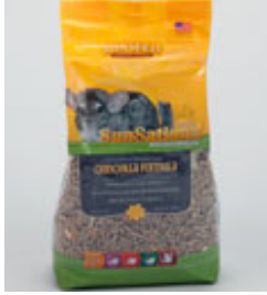
SunSations Chinchilla Diet

Sun-cured Timothy Grass Hay, Dehydrated Alfalfa Meal, Dehulled Soybean Meal, Wheat Middlings, Ground Oats, Ground Wheat, Oat Hulls, Dried Beet Pulp, Dried Cane Molasses, Dehydrated Carrots, Pumpkin Seed, Dried Cranberry, Dicalcium Phosphate, Wheat Germ Meal, Salt, Soy Oil, Calcium Carbonate, Dried Mango, DL-Methionine, Vitamin A Supplement, Choline Chloride, Yucca schidigera Extract, Mixed Tocopherols (a preservative), Riboflavin Supplement, Ferrous Sulfate, Vitamin B12 Supplement, Vitamin E Supplement, Manganous Oxide, Zinc Oxide, Niacin, Copper Sulfate, Menadione Sodium Bisulfite Complex (source of Vitamin K activity), Rosemary Extract, Citric Acid, Cholecalciferol (source of Vitamin D3), Calcium Pantothenate, Pyridoxine Hydrochloride, Thiamine Mononitrate, Biotin, Folic Acid, Calcium Iodate, Dried A. oryzae Fermentation Extract (source of Protease), Dried Bacillus licheniformis Fermentation Product, Dried Bacillus subtilis Fermentation Product, Cobalt Carbonate, and Sodium Selenite.