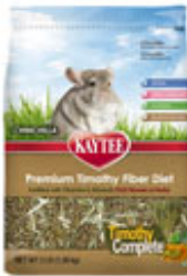
Kaytee® Timothy Complete Plus Fruits & Vegetables

Allergen information: Contains peanuts and/or other tree nuts.