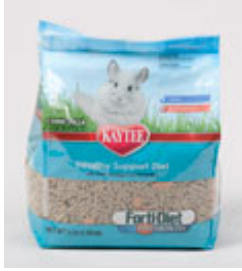
Kaytee® Forti-Diet® Pro Health™

Sun-cured Alfalfa Meal, Dehulled Soybean Meal, Ground Oats, Ground Wheat, Wheat Middlings, Ground Corn, Dried Beet Pulp, Ground Flax Seed, Dicalcium Phosphate, Soy Oil, Dried Cane Molasses, Ground Rice, Wheat Germ Meal, Salt, DL-Methionine, Algae Meal (source of Omega-3 DHA), Fructooligosaccharide, Calcium Carbonate, Yeast Extract, L-Lysine, Yucca Schidigera Extract, Magnesium Oxide, Vitamin A Supplement, Choline Chloride, Mixed Tocopherols (a preservative), Ferrous Sulfate, Riboflavin Supplement, Manganous Oxide, Zinc Oxide, Vitamin B12 Supplement, Vitamin E Supplement, Niacin, Copper Sulfate, Menadione Sodium Bisulfite Complex (source of vitamin K activity), Rosemary Extract, Citric Acid, Cholecalciferol (source of vitamin D3), Calcium Pantothenate, Pyridoxine Hydrochloride, Thiamine Mononitrate, Folic Acid, Calcium Iodate, Biotin, Dried Bacillus licheniformis Fermentation Product, Dried Bacillus subtilis Fermentation Product, Cobalt Carbonate, Sodium Selenite, Artificial Color. Allergen information: Manufactured in a facility that processes peanuts and other tree nuts.