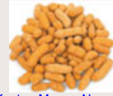
Kaytee Mango Nuggets