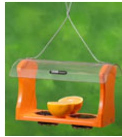
Recycled Plastic Oriole Feeder