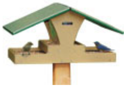
Recycled Hopper Feeders