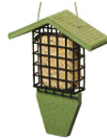
Green Solutions Tail Prop Feeder