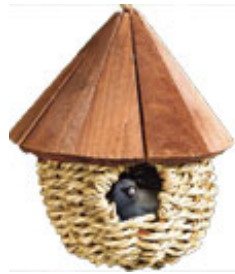
Nesting Huts Birdhouses