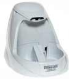
Drinkwell Platinum Pet Fountain