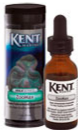
ZooMax Expert Series Zooplankton