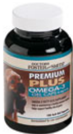
Omega-3 Fatty Acid Capsules