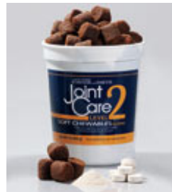
Joint Care 2 with MSM