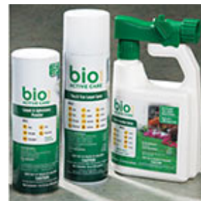
Bio Spot® ACTIVE CARE Environmental Flea & Tick Protection