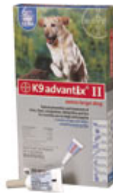
K9 Advantix® II