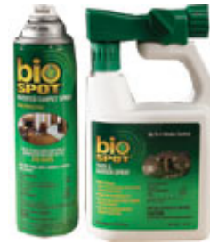
Bio Spot® Carpet and Yard Spray