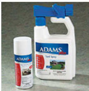
Adams™ Plus Flea & Tick Premises Protection