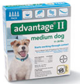
Advantage ® II Topical Flea Treatment for Dogs