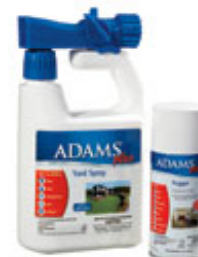
Adams™ Plus Flea