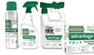
Bayer Advantage® Environmental Treatments