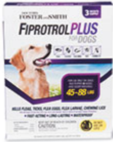
Drs. Foster & Smith Fiprotrol™ Plus Flea & Tick Control for Dogs