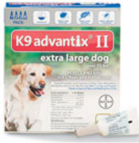
K9 Advantix ® II Flea and Tick Control Treatment for Dogs