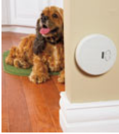
Pawz Away® Indoor Pet Barrier Systems