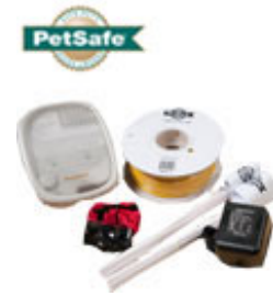
PetSafe In-Ground Fence System