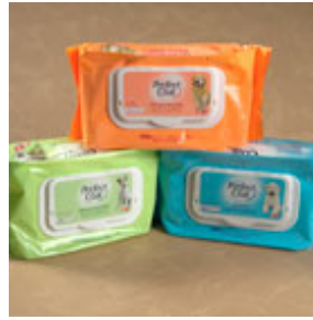
Perfect Coat Bath Wipes for Dogs