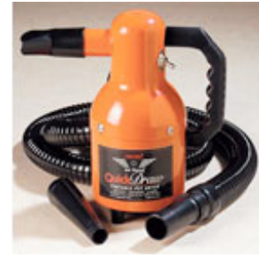
Metro Air Force Quick Draw Pet Dryer