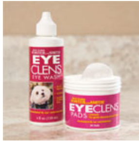
Eye Clens® Eye Wash and Pads