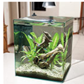
Eheim 9G Aquastyle Aquarium