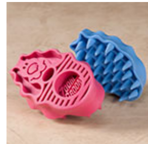
KONG Zoom Groom