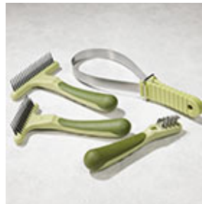
Safari Dog Grooming Tools