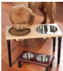
Posture Pro Elevated Diners