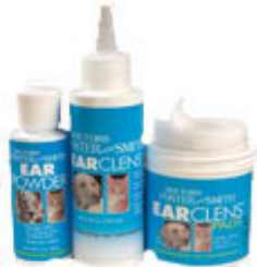
Drs. Foster and Smith Ear Care Kit