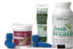
Drs. Foster and Smith Dental Care System