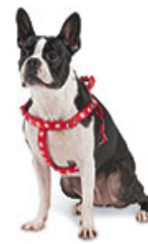
Drs. Foster and Smith Padded Harness