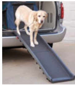
Ultralight Bifold Ramps