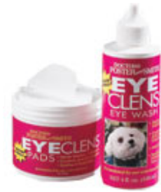
Drs. Foster and Smith Eye Clens® Eye Wash and Eye Pads