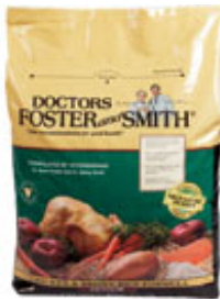
Drs. Foster and Smith Dry Senior Dog Food