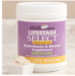
Drs. Foster & Smith Lifestage Select® Premium Senior Dog Multivitamin & Mineral Supplement