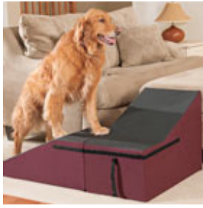
Drs. Foster & Smith Dura-Ruff® Indoor Ramp