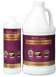
Drs. Foster & Smith Instant Ammonia Remover