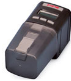
Eheim 3581 "Feed-Air" Digital Automatic Feeder