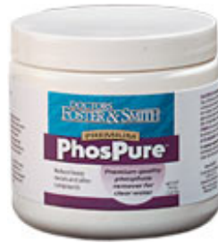
Drs. Foster & Smith PhosPure® Filter Media