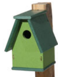
Going Green Bluebird House