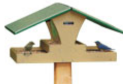
Recycled Hopper Feeder