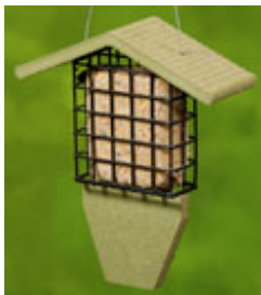
Green Solutions Tail Prop Feeder