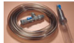
Aqueon Aquarium Water Changer