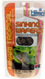
Hikari Sinking Wafers