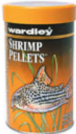
Wardley Shrimp Pellets