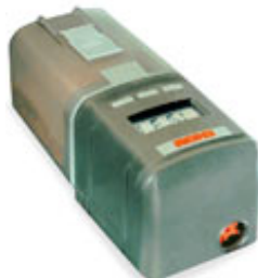
"Feed-Air" Digital Automatic Feeder