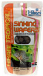
Hikari Sinking Wafers