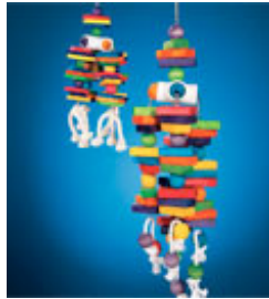
Four-Way Play Activity Center