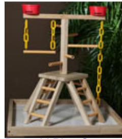
Pyramid Play Gym

Birds learn to operate the four easy-press buttons to activate fun phrases and captivating lights.