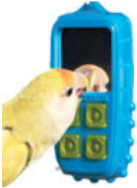
Talk 'N Play Bird Toy