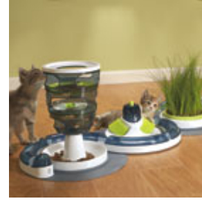
Catit Senses Activity Toys