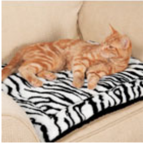
Drs. Foster & Smith Cozy Cushion® for Cats