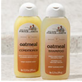
Drs. Foster & Smith Advanced Formula Oatmeal Shampoo & Conditioner