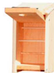
Convertible Winter Roost Bird House