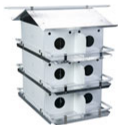
12 Room Purple Martin Bird House