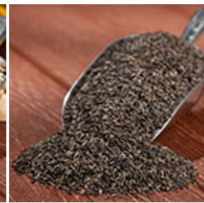
Drs. Foster & Smith Nyjer Thistle Seed