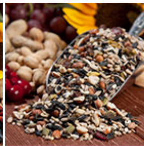
Drs. Foster & Smith Premium Specialty Blends® Nut, Seed & Berry Blend