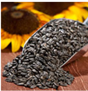
Drs. Foster & Smith Black Oil Sunflower Seed