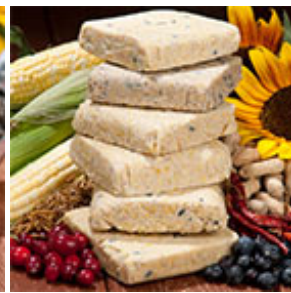
Suet Plus Blend Cakes