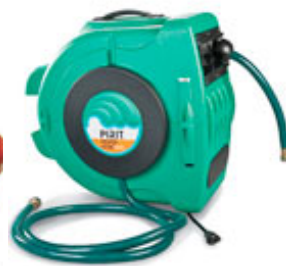
Pirit Hose with Heated Reel