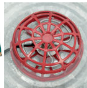
K&H Manufacturing Ultimate Bucket