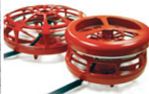
Ultimate Stock Tank De-Icer from K&H Pet Products