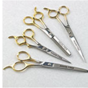
Stainless Steel Shears