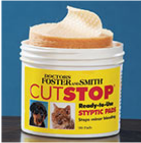
CutStop® Styptic Pads