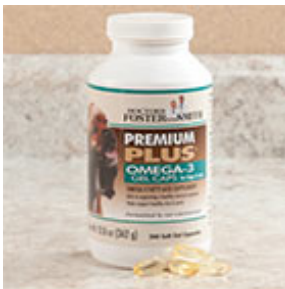
Premium Plus® Omega-3 Gel Caps