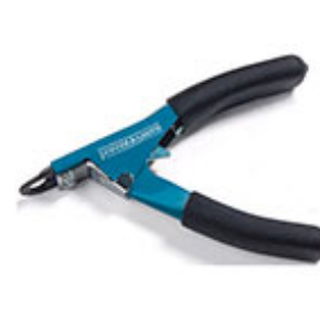
Nail Trimmer Kit