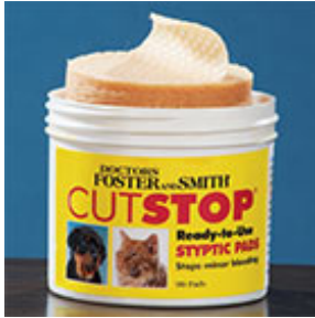
CutStop® Styptic Pads