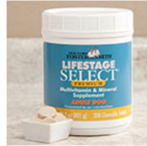
Lifestage Select® Premium Adult Dog Multivitamin & Mineral Supplement