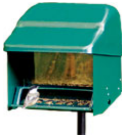
Super Stop-A-Squirrel Feeder