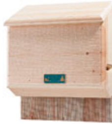
Sunshine's Bat House