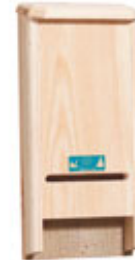
"Bat"chelor Pad Condo