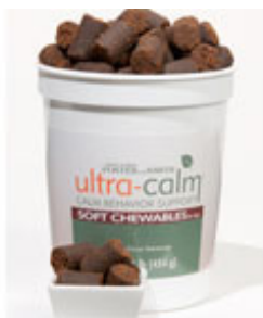
Drs. Foster & Smith Ultra-Calm® Soft Chewables