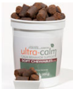
Drs. Foster & Smith Ultra-Calm® Soft Chewables