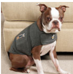
Thundershirt™ for Dogs