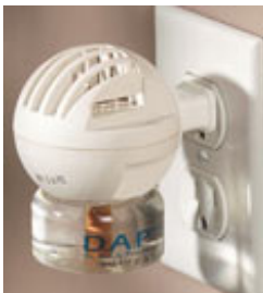
Comfort Zone® Plug-In