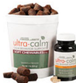
Ultra-Calm® Tablets or Chews