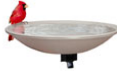
EZ - Tilt Heated Birdbath