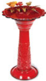
Red Metal Birdbath