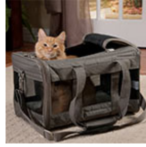
Original Deluxe Sherpa Soft-Sided Carrier