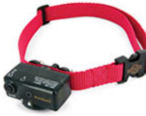
PetSafe® Deluxe Bark Control Collar™