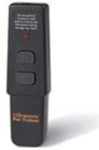
PetSafe® Collarless Ultrasonic Remote Trainer