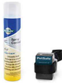
PetSafe® Anti-Bark® Spray Collar™