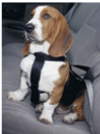
Car Safety Harness