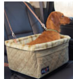
Solvit Pet Booster Seats