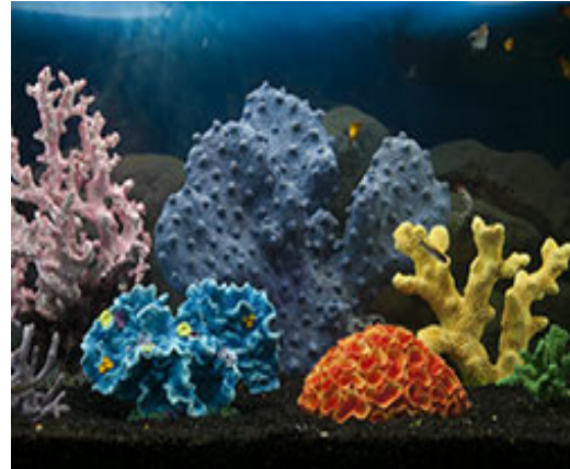
Gorgeous artificial corals are perfect for FOWLR aquariums.

With aquarium decorations, your aquascaping options are endless. Would you like an enchanting coral reef in your freshwater aquarium? Or, how about gorgeous freshwater plants in your saltwater aquarium? One of the best benefits of aquarium decorations is that