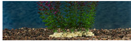
Mix various artificial plants for a lush display.

to disguise unsightly plumbing. Fuse function with flair by cleverly concealing in-tank filters and plumbing with the beauty of aquarium ornaments. Let your creativity flow and choose from our ample supply of decorations. For example, a thicket of tall, artificial plants, or maybe even a spooky sunken ship strategically placed in front of your filter, powerhead, heater, etc., instantly makes your aquarium more aesthetically pleasing, while still remaining functional.