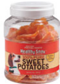
Drs. Foster & Smith Healthy Snax® Sweet Potato Dog Treats