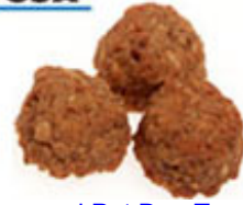
Pampered Pet Dog Treats