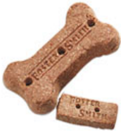
Drs. Foster & Smith Premium All-Natural Biscuits