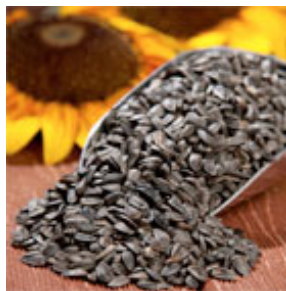
Black Oil Sunflower Seed