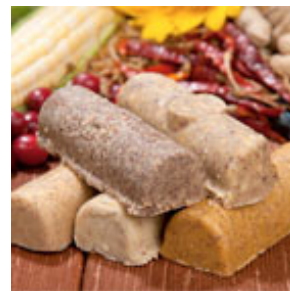
Log Jammer Suet Plugs