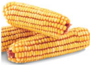
Cobs of Corn