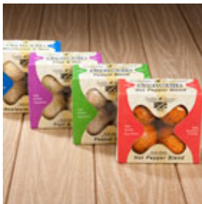
Wildlife Sciences Suet Ball 4-pack