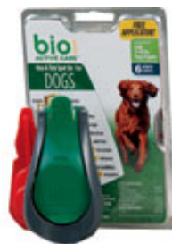
Bio Spot® ACTIVE CARE SPOT ON® for Dogs

Hot spots seem more common in dogs with heavy undercoats and/or long haircoats. Humidity and moisture may both play a role, so long-haired or heavy-coated dogs must be dried thoroughly after swimming or after a bath. Dogs with a history of allergies or ear infections, and those who are allowed to become infested with fleas, or those whose grooming needs are not met (i.e., dogs who have a lot of tangles or mats) are all predisposed to this painful condition.