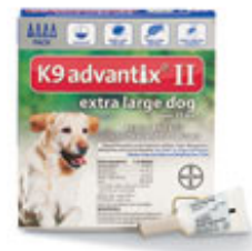
K9 Advantix® II