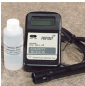
Pinpoint Salinity Monitor