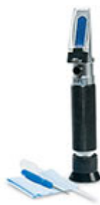
LiveAquaria.com Seawater Refractometer