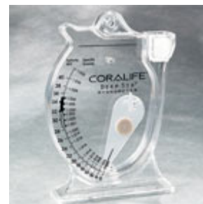
Deep Six Hydrometer