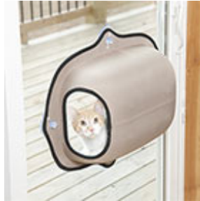
EZ Mount Window Pod™ for Cats