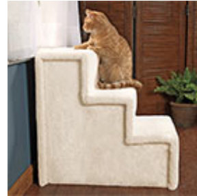
Drs. Foster & Smith Heavy-Duty Carpeted Steps