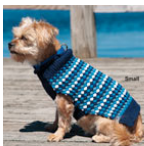
Clothing for Small Dogs