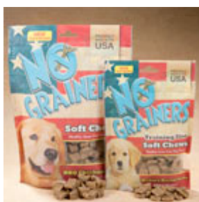
Nootie No-Grainers Soft Chew Treats