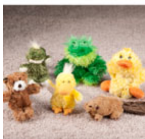
KONG Plush Toys - XSmall & Small